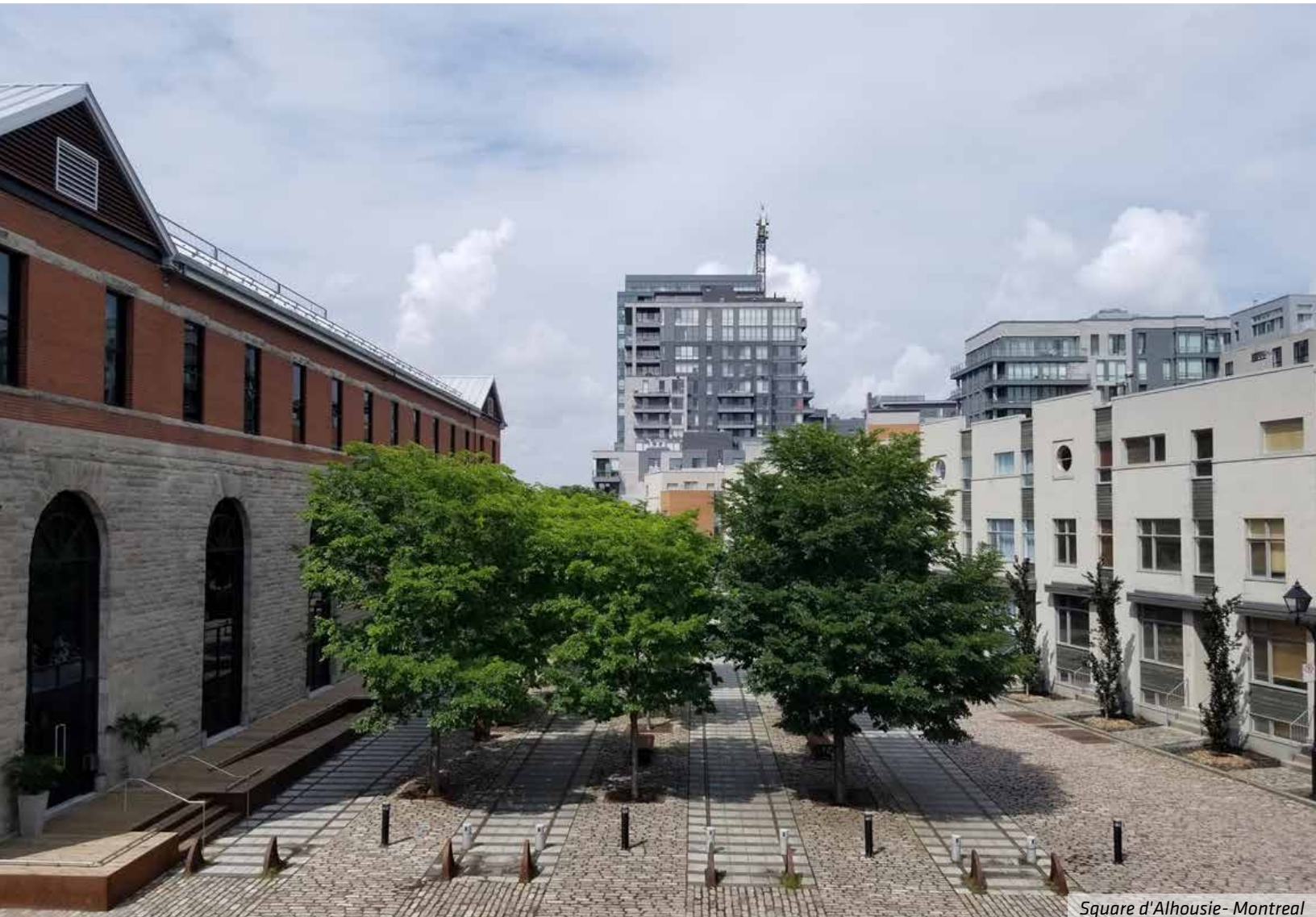
Square d'Alhousie - Montreal

CU-Structural Soil® is a revolutionary new tree rooting mix for urban environments.