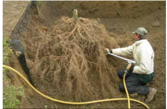
Excavated roots of tree growing in CU-Soil®

The most common uses for CU Structural Soil are, commercial planting, streetscapes and urban tree plantings. CU Structural Soil can be used before planting but also retrofit to encourage growth in existing trees.